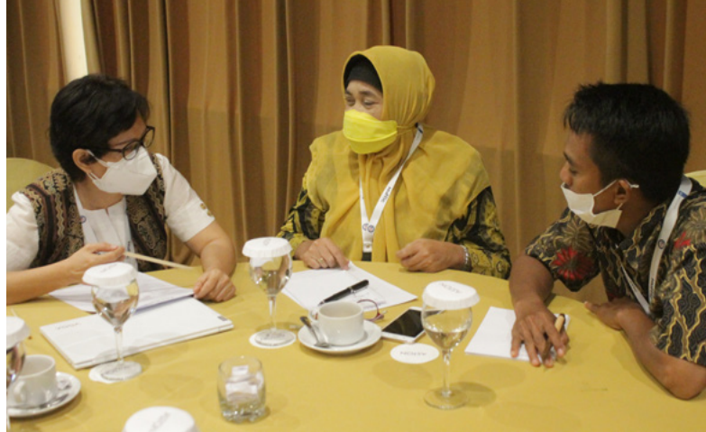
Sharing and learning among lecturers as a key strategy towards sustainability.

a 'hub' and contact point for the network post-project. UGM will continue to host the SLEEI website and organize the dissemination of SLEEI materials, such as the resource guide. There is certainly great interest in and support for SLEEI's type of innovation from other law faculties in the country, as is evident from discussions during the SLEEI national conference held in early 2022 that led to the Mataram Declaration (Box 2). It will be up to the emerging network and its allies to find the means and resources to meet this demand.