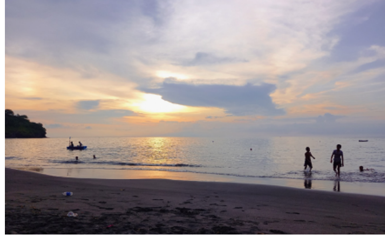
Maritime Law is important in the local context of Eastern Indonesian islands.

Interactive teaching is crucial if the above forms of awareness and legal skills are to be achieved. As is evidenced across all forms of teaching, through interactive teaching students become active learners, are encouraged to develop their problem analysis skills, and are urged to be open to and able to handle different perspectives.