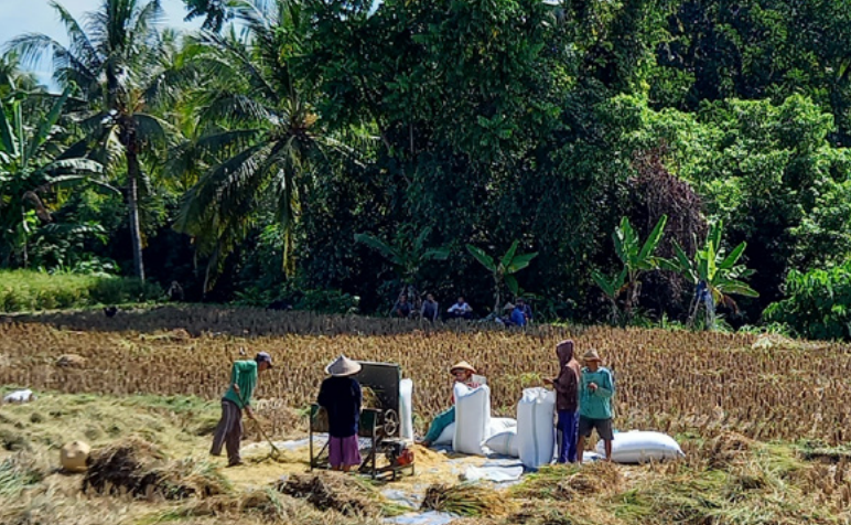
Gender aspects in agricultural law, labor law, and inheritance law affect rights of these women harvesting rice.